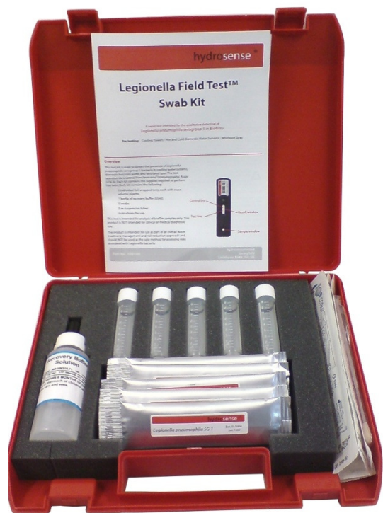
Legionella Biofilm Test TM Product code 100144

The hydrosense ® Legionella Field Test TM uses an immunochromatographic assay, to detect the presence of cell surface antigens from Legionella bacteria in a sample. The presence of antigen causes the “Test Line” to turn red in colour. A “Control Line” is included which should always turn red if the test has been performed correctly.