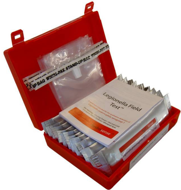
Legionella Field Test™ Product code 100104

The hydrosense® Legionella Field Test™ uses an immunochromatographic assay, to detect the presence of cell surface antigens from Legionella bacteria in a sample. The presence of antigen causes the “Test Line” to turn red in colour. A “Control Line” is included which should always turn red if the test has been performed correctly.