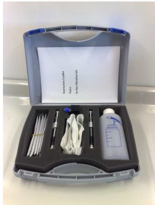
Industrial Legionella Test TM Product code 100182

The hydrosense ® Legionella Field Test TM uses an immunochromatographic assay, to detect the presence of cell surface antigens from Legionella bacteria in a sample. The presence of antigen causes the “Test Line” to turn red in colour. A “Control Line” is included which should always turn red if the test has been performed correctly.